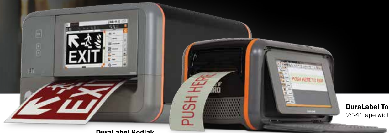
DuraLabel Kodiak 4"-10" tape widths