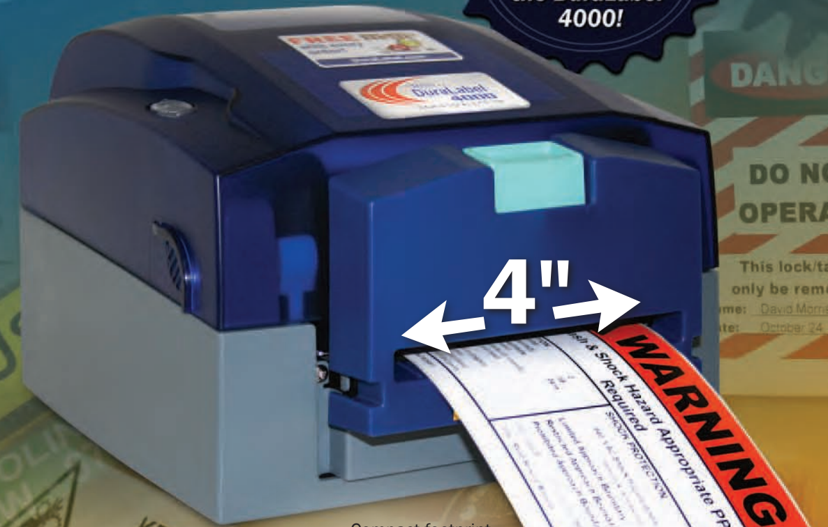
Compact footprint 10"(L) x 6.7"(H) x 8.8"(W)

Create custom industrial quality labels & signs with ease using the DuraLabel 4000!