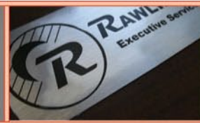
Metallized Poly Tape