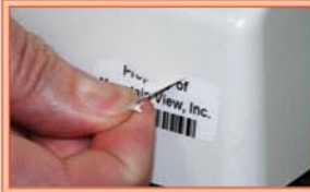
Tamper-Evident Destructible Tape