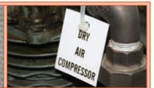
DuraTag™ (Tag Stock)