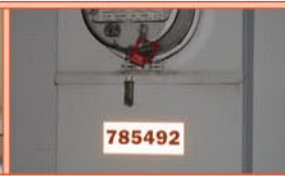
Reflective Vinyl Tape