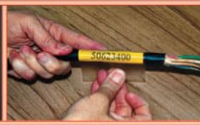
Self-Laminating Wire Wraps