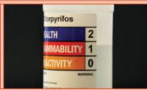
NFPA Diamond/RTK Color Bar Labels