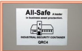
UL 969 Compliant Poly Tape