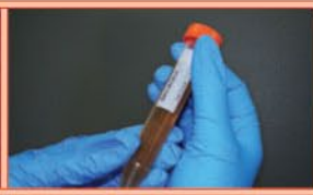
LN2 Poly Tape (from -112°F to -176°F)