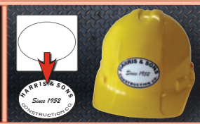
Blank Die-Cut Labels