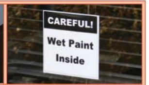
Static Cling Supply