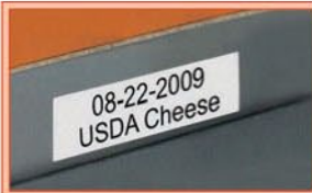
Cold Storage Tape (as low as -40°F)