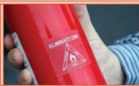
Clear Matte Poly Tape