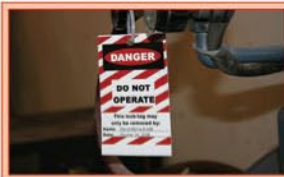
DuraTag LOTO Tag Stock