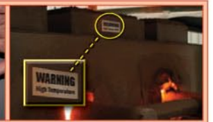
Extreme High-Temp Poly Tape (up to 700°F)