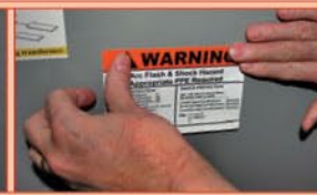
Arc Flash Labels