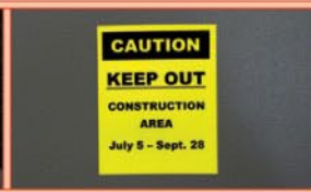
Fluorescent HiViz Tape