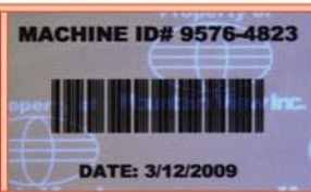
Custom UV-Watermark Tape