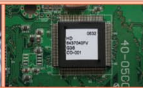
Circuit Board Polyimide Tape