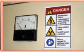
Custom Multi-Color Labels