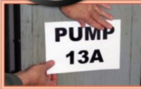
Oily Surface Tape