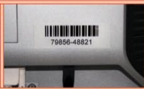
Electrostatic Dissipative Tape