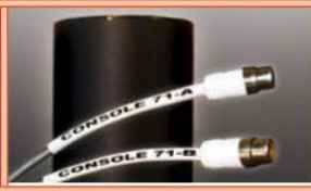
Shrink Tubing Ribbon