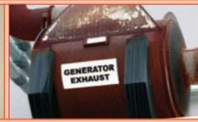
High-Temp Poly Tape (up to 400°F)