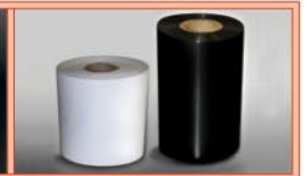
DuraChem Chemical Resistant Tape & Ribbon