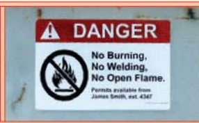
Health & Safety Labels

Call us at 1-800-788-5572 We'll get your world streamlined, organized and labeled in no time.