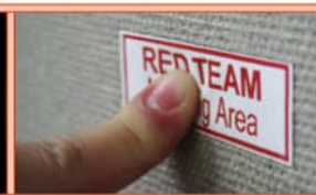
Nylon Label Tape (great flexibility)