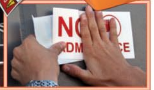
Ultra-Aggressive Adhesive Vinyl Tape