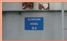
Extended-Life Vinyl Tape