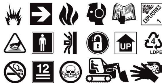
Over 1300 commonly used industrial symbols