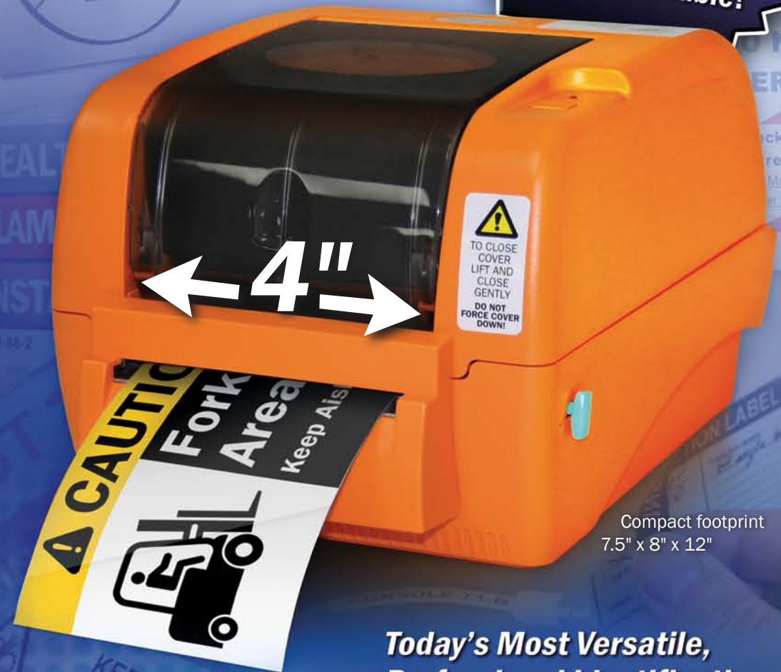
Compact footprint 7.5" x 8" x 12"

Today's Most Versatile, Professional Identification and Marking Systems