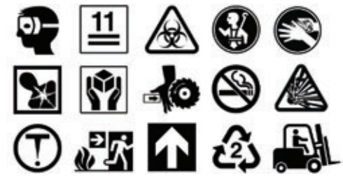
Over 650 industrial symbols available