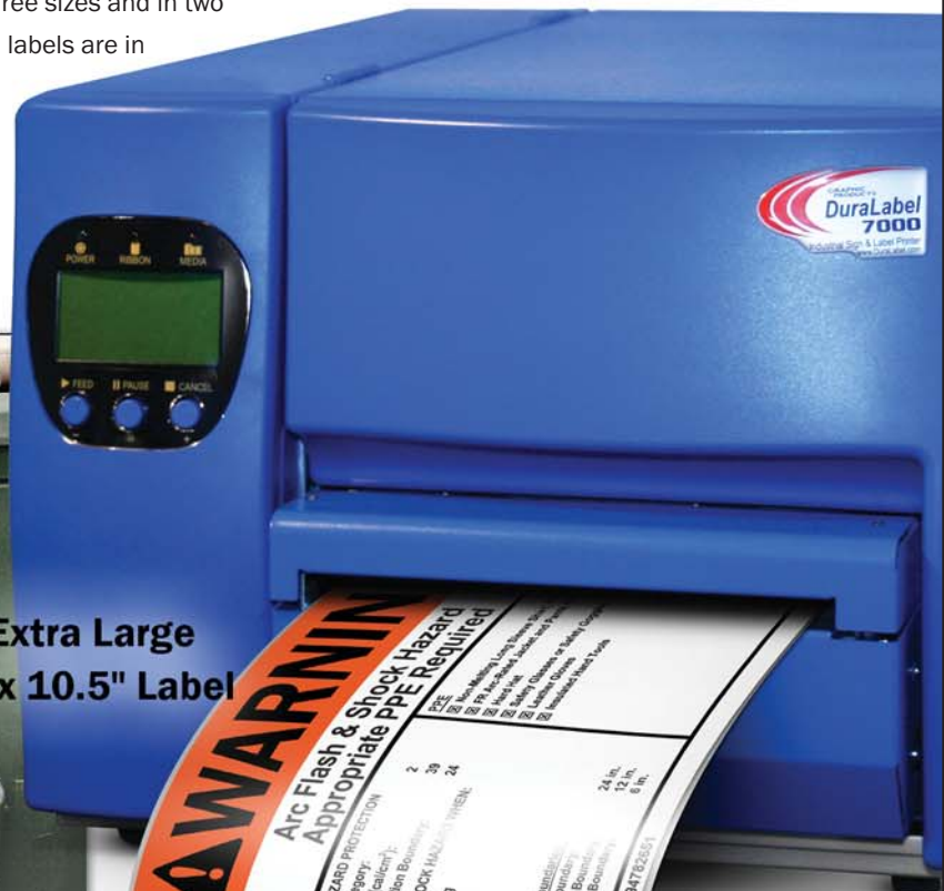
Extra Large 7" x 10.5" Label

Print quality labels and signs when you need them! Whether you need large signs to be seen from a distance or small labels with detailed information, the DuraLabel line of printers will do it all!